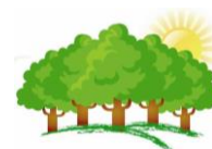
Harborough District Community Safety Partnership Harborough Community Safety Partnership